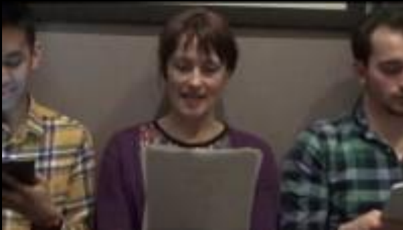
Vic confronts Larry in the diner