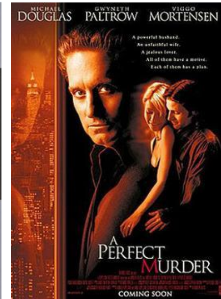
A Perfect Murder

Edgar Allen Poe Award nominee for Best Picture 1991